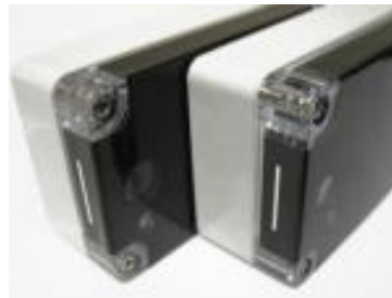
Legacy Service Markings